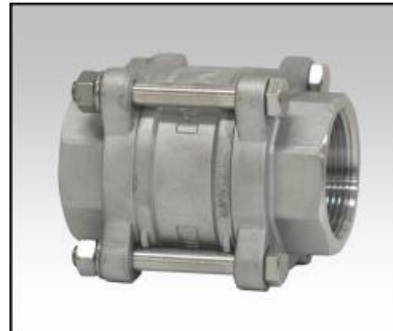
Pressure Vs. Temperature Chart for Valve V_4 (DN8) to 4" (DN100)