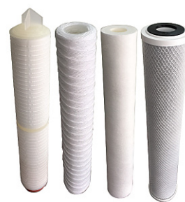
Filter types to suit housing