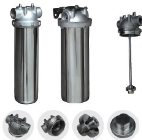
Filter housing assembly