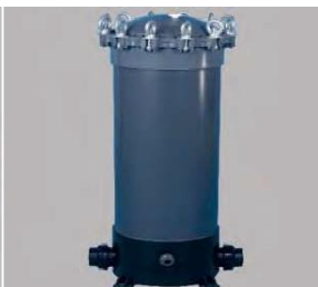
PlasFlow UPVC Cartridge Housing